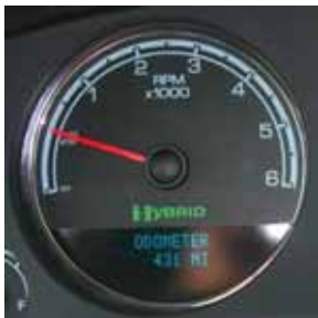
Tachometer with Auto Stop Indicator

A tachometer with Auto Stop indicator and an Economy gauge are unique to these vehicles